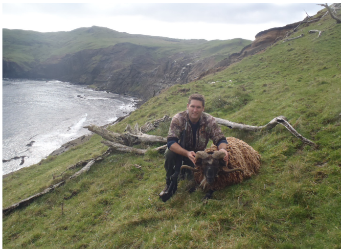
There were quite a few rams with good heads.

One of my priorities was to get over to Pitt Island, inhabited by 30 people, to hunt wild saxon merino rams which are black woolled sheep. The cessna was not flying due to the airstrip being muddy so I made a few calls and managed to get a ride over on a cray boat. We left the Chats at 6am and an hour later were picked up by a guy I had done some work with on the wharf at Pitt Island. Away hunting we went for the day seeing many wild sheep and a couple of good rams. The hunting is easy, involving cruising around on bikes and stalking likely areas of bush or coastline. I was fortunate that my mate was a local so knew all the spots. It wasn't hard to find some rams, the difficult part is working out how good they are as some have tighter curls or more wool around the bases than others. I shot two rams and a lamb. We were back on the wharf by 4pm to be picked up by the cray boat, and we were back on the Chats in no time. The skipper of the cray boat wouldn't even accept money for diesel.