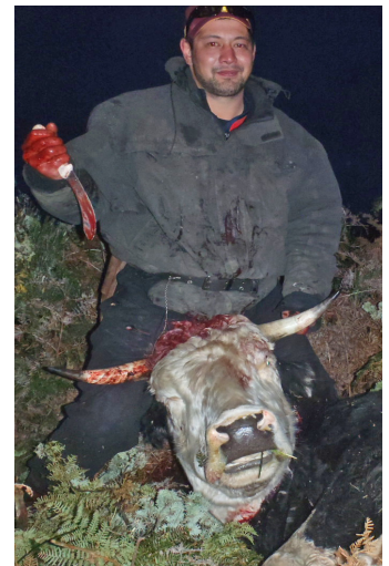
Just drive the bike on it bro!

While having dinner one night at the one and only pub, my girlfriend recognised one of the guys from her school days. I went and said giddy which led to a huge night on the beers with the locals. That in turn led to two of the guys taking us out to get some dog tucker...wild bull. Away we went the next afternoon eventually seeing a lone bull and a mob of about 5 cattle. As we "stalked" the mob on our bikes the lone bull broke close to us and our mate took off after it flat stick on his bike. The country is rolling, ferny and swampy with lots of ruts and holes. Our mate was absolutely gunning it after this bull disappearing and reappearing as he bounced his way like a madman just behind the bull. I tried to keep up with him, the last vision I had of him was him riding right beside the bull at full pace. When I finally caught up with him, there he was with the bike on top of the dead bull. Turns out he had employed an old tactic of knocking the bull over with his bike, pinning it down with his bike, then jumping on its back and killing it with his knife! I left him to it and went after the mob, which had one bull with them. Rather than give my mates hunting method a go I thought I would keep things simple and wait for a clean shot. From 80 or so yards out the bull turned side on and I squeezed a shot off into its neck dropping it on the spot.