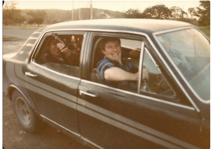
A good strong hunting vehicle is essential to any hunting trip. I am pleased to see that the boys are obviously keeping well hydrated. Recognise any of them?