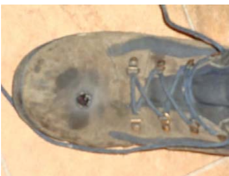
Be Careful With Firearms!!!

Check the National NZDA website www.deerstalkers.org.nz